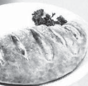
Folded Pizza Stuffed With Mixture of Cheeses.